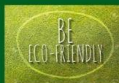
Be Eco friendly