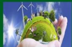
Conserve natural resources