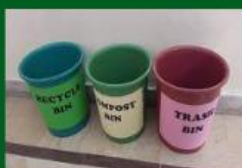
Wisely dispose waste