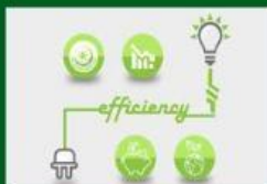
Be energy efficient