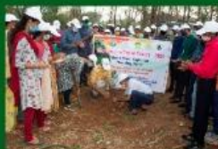
Plant more trees