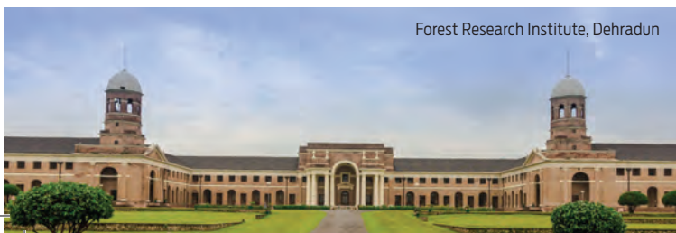
Forest Research Institute, Dehradun

Tele/fax: +91 471 2722151 | Email: biodiversitycongress@gmail.com