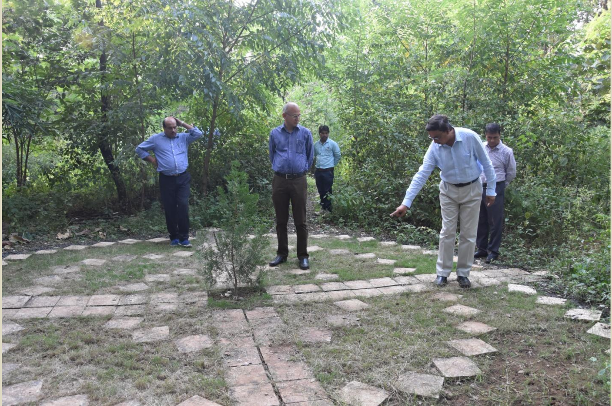
Bamboo nursery visit