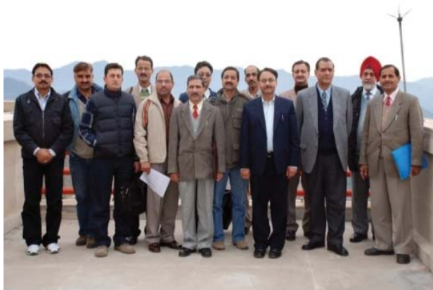
Network partners during the workshop

Status: This is a multi-institutional project. To draw roadmap for implementation of the project, two workshops were organized at Himalayan Forest Research Institute (HFRI), Shimla and Jaypee University of Information & Technology (JUIT), Wagnaghat, Solan. The protocols have been developed for administrative and research issues. Published the brochure on Picrorhiza kurrooa and Valeriana jatamansi for proper identification of the species in the field. Existing available strains of both the species have been sent to IHBT, Palampur and JUIT for analysis of active ingredients.