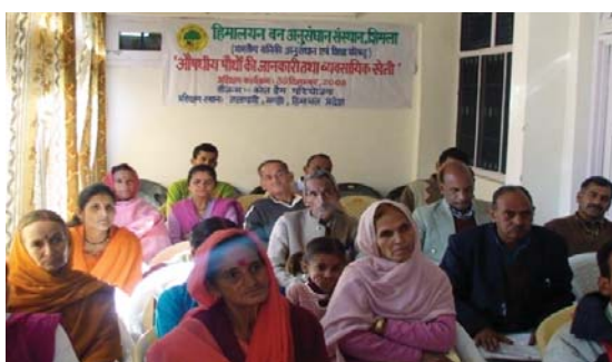
Training on “Commercial Cultivation of Medicinal Plant”