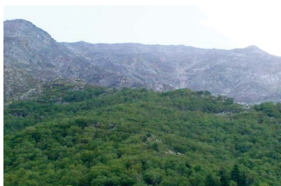
Betula utilis Forest

Findings: Phytosociological studies were carried out at various altitudes in Doje forest, Kanasa area and Shone Khad area of Rakchham beat; Hitch Pawang, Murti Panag, Rani kanda to Jarra and Tumer area of Chitkul beat; Rasrang, Hurba and Shingan area of Batseri beat of the sanctuary. In Doje Forest, number of trees, shrubs and herb species were 15, 31 & 117 with dominance of Betula utilis , Hippophae salicifolia and Polygonatum verticillatum respectively. In Kanasa Nala, number of trees, shrubs and herbs species