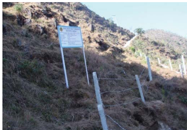
Multi-location trial of Jatropha

Plantation of rooted cuttings carried out during October 2008, as per the statistical design provided by DBT Jatropha National Coordinator. Seeds of 19 superior accessions of Jatropha curcas received from NBPGR have been sown in institute's nursery at Bir Plassi Nalagarh (H.P.) during October 2008. The germination behaviour of these seeds was recorded in the nursery. The growth & survival data are being recorded regularly both at the plantation site and at the nursery.