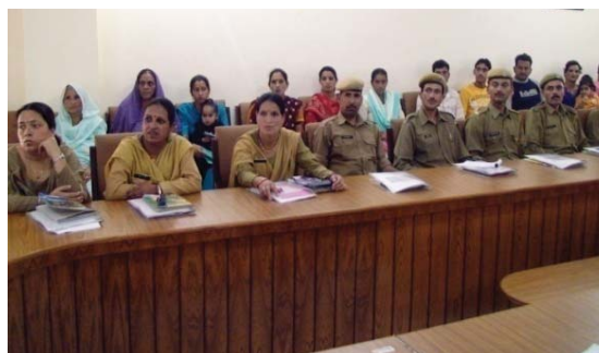
Training on "Forestry Interventions for Eco-restoration of Degraded Land"