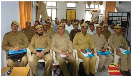
Training on “Integrated Pest Management in Chir-Pine”