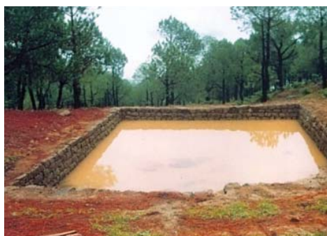
Water harvesting structure constructed

Participatory Forest Management may not have achieved its objectives completely but it has brought positive change in mind frame and thinking of local people and field staff towards the forest conservation.