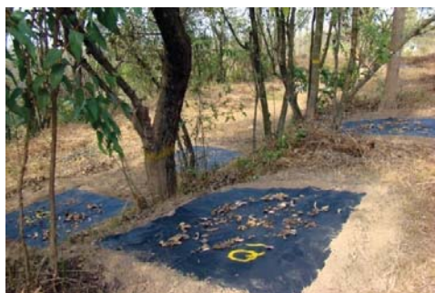
Evaluation of Soil fertility status

Project 2: Evaluation of soil fertility status and nutrient return from the important indigenous agroforestry tree species in Himachal Pradesh with special reference to Hamirpur district [HFRI-034/08(AGF-04)/PLAN/2006-11]