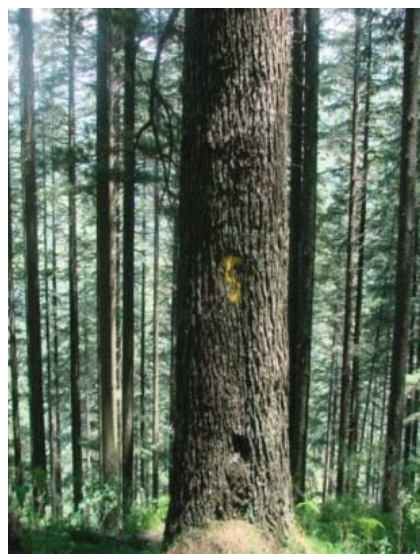
Selected trees of Deodar for DNA analysis

Status: Carried out survey and selected forest near Shillaru in Shimla district for extraction of Deodar wildlings for experimental purposes under the project. Besides this, also selected a site near Shillaru nursery for establishing pilot scale field trial. Carried out experimental plantation of Deodar tall wildlings during August 2008 on that selected site. Nursery studies for raising tall plants could not be initiated as Deodar seeds of last year's collection (2007 was considered as bad seed year in case of Deodar) failed to germinate in nursery. Fresh seeds of Deodar were collected during October 2008 and subsequently sown in the nursery for studying the techniques of raising Deodar tall plants. Growth and survival data pertaining to experimental plantation are being recorded regularly. However, initial field survival results of Deodar tall wildlings are not encouraging.