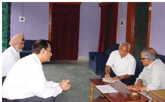
Meeting of Director, HFRI, Shimla with Hon'ble Minister of Environment & Forests, Government of J&K