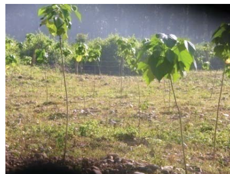
Performance trail of Gmelina arborea

Status: Nurseries of Gmelina arborea have been raised at Bir Plasi (Nalagarh), Johron (Paonta Sahib) and Nagbani (Jammu) for raising field plantations. Field plantations-cum demonstration plots have been raised at Puruwala (Paonta Sahib) in district Sirmour and Kot in Hamirpur district of Himachal Pradesh. Survey for taking up field plantation in the state of Jammu and Kashmir is being undertaken. Growth data of the seedlings at nursery stage and in plantation area have been recorded. Preliminary results are encouraging.