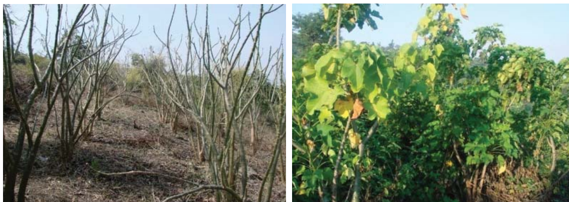
Demonstration Plantations of Jatropha curcas

Status: Raised and maintained about 2.20 lacs nursery stock of Aconitum heterophyllum Wall. ex Royle (Atish) & 1.05 lacs nursery stock of Angelica glauca Edgew (Chora) at two nurseries of the Institute viz., Shillaru nursery (Shimla) and Brundhar medicinal plants nursery (Manali) during 2008-09. The nursery activities mainly included preparation of land for nursery beds, sowing/pricking, shading, irrigation and other maintenance activities. Overall, up to March 2009, the Institute has raised 3.80 lacs of quality planting material of Atish and Chora under this project in different nurseries. Under extension activities of the project, Institute has successfully organized two training & demonstration programmes on 'Commercial cultivation of Atish & Chora' at Mashobra, Shimla on 29 th August 2008 for 44 farmers & field functionaries of SFD, Himachal Pradesh and at Mahunaag in Karsog Forest Division of Himachal Pradesh on 5 th December 2008 for 60 numbers of farmers, members of Mahila Mandal, NGO & field functionaries of SFD, Himachal Pradesh. Besides these, around 2.00 lacs QPM of Atish and Chora distributed to various end users during the year. The project has completed its period of 3 years on 31 st March 2009; however, one year extension for the project is under consideration with the funding agency to fully achieve all the objectives of the project.