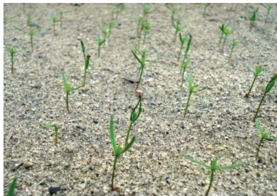
Seed Germination in Juniperus polycarpus