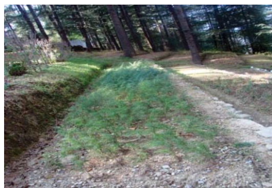
Progeny trial of Cedrus deodara

Status: The matter to obtain culling permission from the competent authority was pursued with Principal Secretary, Forests Government of Himachal Pradesh, PCCF of Himachal Pradesh and Director, State Forest Research Institute, Jammu from time to time so that seed stands are converted into Seed Production Areas (SPAs). However, the culling permission is yet to be obtained. Progeny trial is being maintained in the nursery and growth data being recorded periodically.