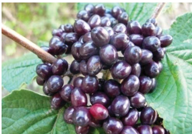
Fruits of Viburnum cotinifolium