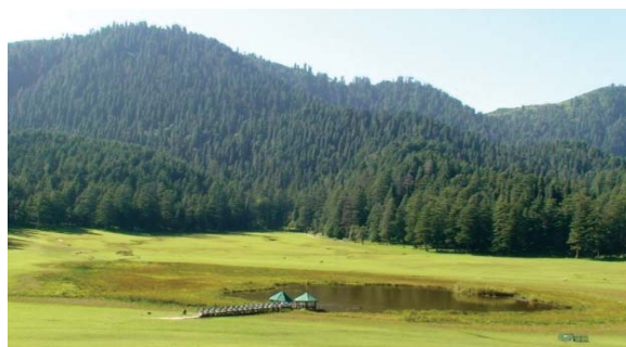
General View of the Sanctuary

Status: Selected the study sites and carried out phytosociological studies in alpine pasture from Dankund to Jyot, altitude wise from Lakadmandi to Khajjiar and Khajjiar to Sach areas of Kalatop-Khajjiar Wildlife sanctuary. Total number of plant species in alpine pasture from Dankund to Jyot were about 30. Documented the plants of medicinal value from the studied areas.