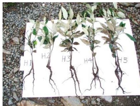
Graded Nursery Stock of Deodar & Ban Oak

Status: The germination data of Fraxinus xanthoxyloides seeds treated with different conc. of gibberellic acid ranging from 500 ppm to 3000 ppm statistically analyzed and maximum 74% germination was recorded in seeds treated with 1500ppm gibberellic acid as compared to control which registered only 19.66% germination. Similarly, good germination was observed in Juniperus polycarpus seeds treated with different presowing treatments.