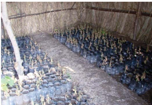
Nursery stock of superior accessions

Status: Total 504 no. rooted cuttings of superior accessions of Jatropha curcas from HAU, NBRI and Biotech Park were received in New Delhi during September 2008. For establishing experimental plantation of Jatropha curcas , a site was selected at village Solag, Panjgai in Bilaspur district of Himachal Pradesh (N 31°21.356' E 76°49.737', Elevation: 938m).