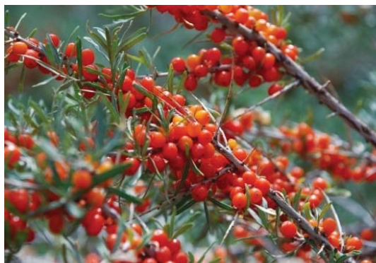
Hippophae rhamnoides sub sp. turkistanica