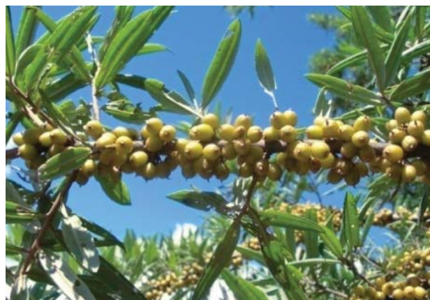
Unripe fruits of Hippophae salicifolia

Status: Collected plant samples (needles) from 11 populations from the state of Himachal Pradesh. These samples were collected from 50 individual trees selected randomly within the population with each selected tree photographed, numbered and geo-referenced. Standardized genomic DNA isolation and purification techniques at FRI, Dehradun.