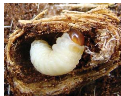
Mature grub of C. rufescens before pupation