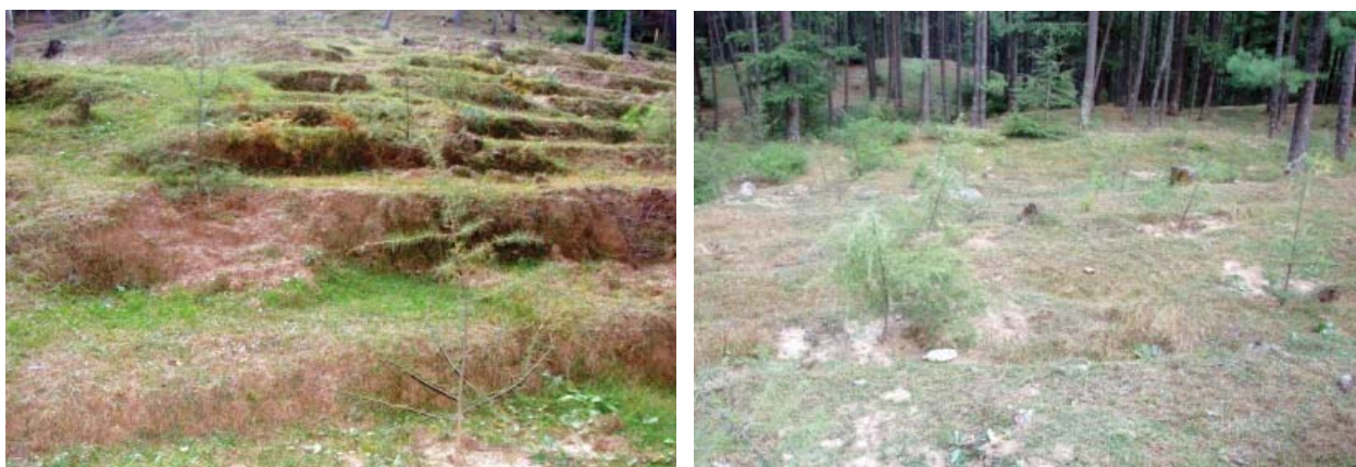
Field Planting of Tall Wildlings of Deodar