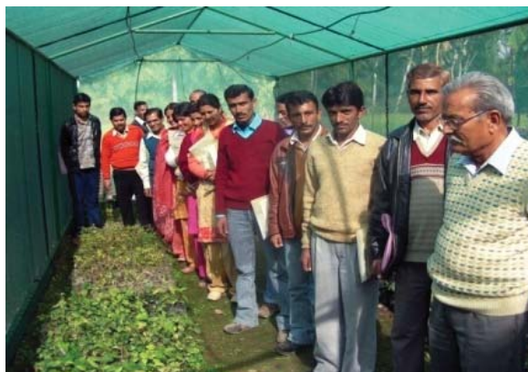
Visit to Green House at Shyampur