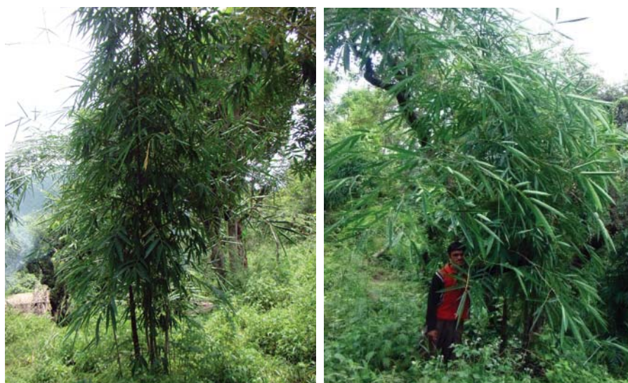
Performance of Tissue Culture Raised Plants

Status: Raised 50 ha demonstration plots of Tissue Culture and Stem Cutting raised Dendrocalamus hamiltonii at Dhadiyarghat in Solan Forest Division. The Tissue Culture raised plants have shown 84 per cent survival and Stem Cutting raised has survived up to 95 percent. Monkeys, Porcupines and landslides were the main reasons of mortality. The growth data are being recorded periodically.