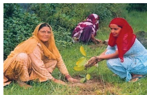
Women participation in plantation activities

Findings: The most preferred species of timber, fuel and fodder were documented by local people in different PFM areas of Himachal Pradesh. The role of women in PFM was studied. It was found that as per the guidelines of VFDC formation under PFM, women were given due representation in the state of Himachal Pradesh. However, practically in the execution of work, their role was not up to satisfactory level except in few VFDs, such as, Dhalwan in Mandi Circle and Kohbag in Shimla Circle, etc. The