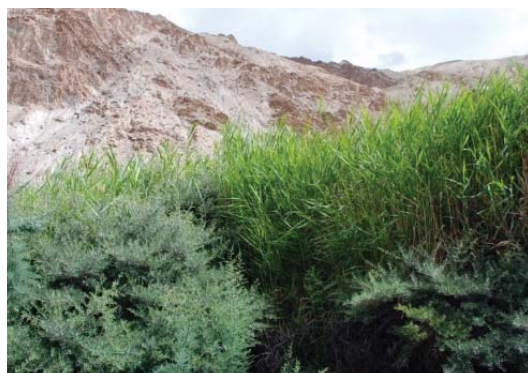
Hippophae and Phragmites formations