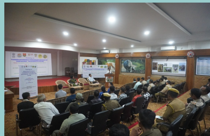
Training programme on “Propagation and Cultivation of Schumannianthus dichotomus ” by ICFRE-RFRI, Jorhat