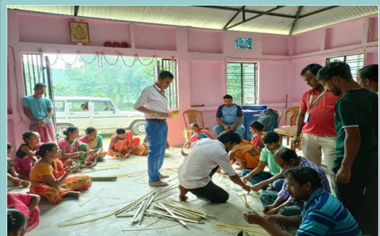
Training programme on “Bamboo Jewellery and Utility Handicrafts for Livelihood Development” by ICFRE-RFRI, Jorhat