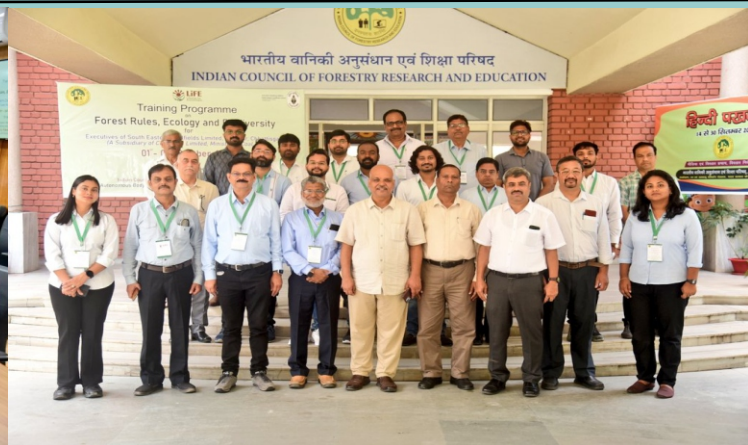
Training programme on “Forest Rules, Ecology & Biodiversity” by ICFRE, Dehradun