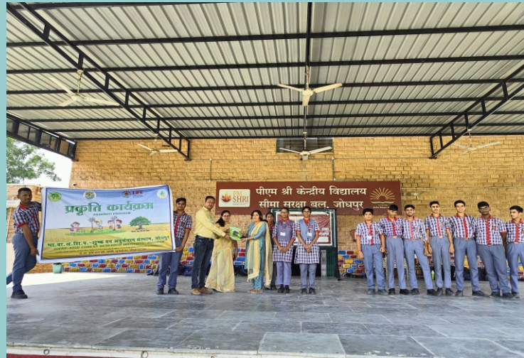
Visit of students from PM Shri Kendriya Vidhyalaya, Border Security Force, Jodhpur to ICFRE-AFRI, Jodhpur

participated in the programme. Lecture on Work being done by AFRI for Environment and Biodiversity conservation along with the technologies developed by institute were also delivered to students.