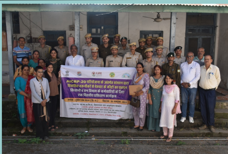
Training programme on “Ecofriendly Insect-Pests management of Shisham and Deodar in nursery and plantation” by ICFRE-HFRI, Shimla