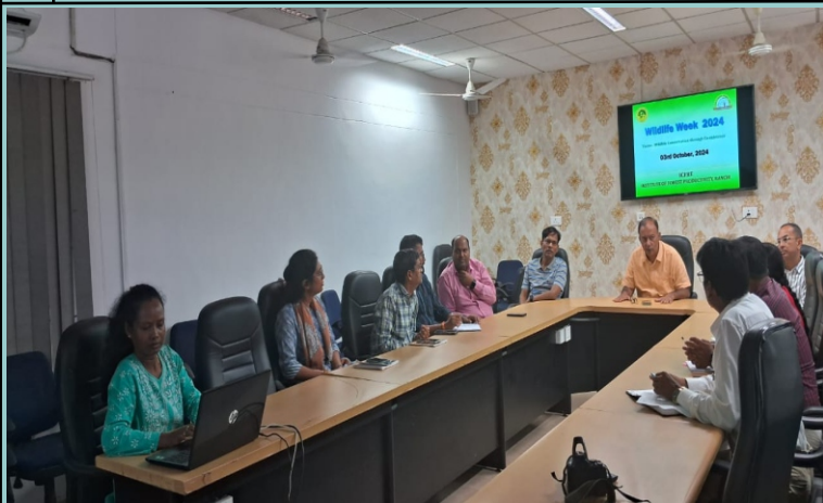
Workshop on “The wild tree sapling and other forest species to be planted for the restoration of mines and such plant species which can nurture wildlife” by ICFRE-IFP, Ranchi