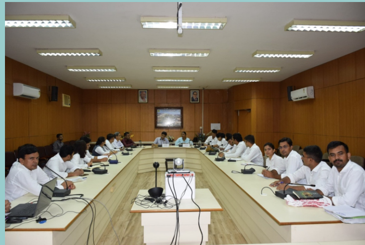
46 ACFs trainees from CASFOS, Burnihat, Assam visited ICFRE-AFRI, Jodhpur