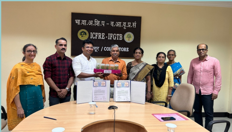
Signing of MoU between ICFRE-IFGTB, Coimbatore and Kygros Agritec & Tropical Biosciences, Pala