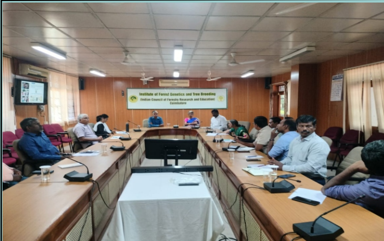
Workshop on “Presentation of New Project Proposal for Financial Assistance” by ICFRE-IFGTB, Coimbatore