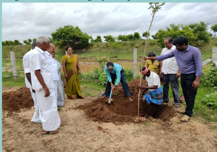
Inaugurated the Planting activity by ICFRE-IFGTB, Coimbatore at Demo Village, Gudalur panchayat, Dindigul, Coimbatore