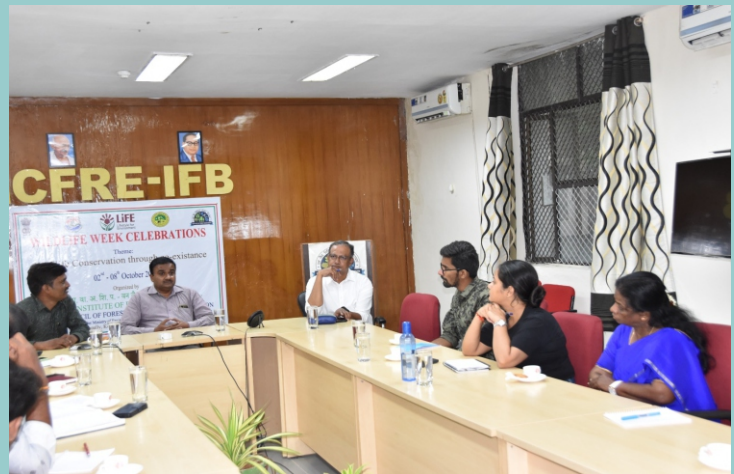
Workshop on “Tools and Technologies developed by Forest- PLUS 2.0/3.0” by ICFRE-IFB, Hyderabad