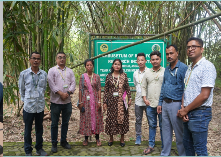
Training programme on “Skill Development training on Bamboo” by ICFRE-RFRI, Jorhat