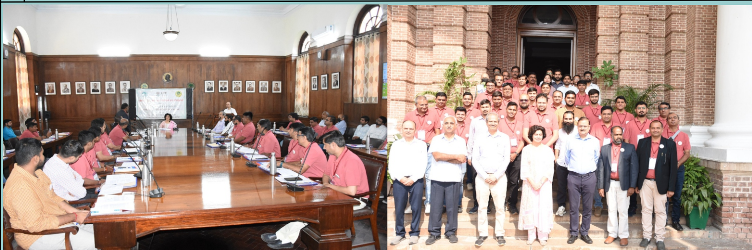
Training programme on “Seasoning & Preservation of Wood & Bamboo” by ICFRE-FRI, Dehradun