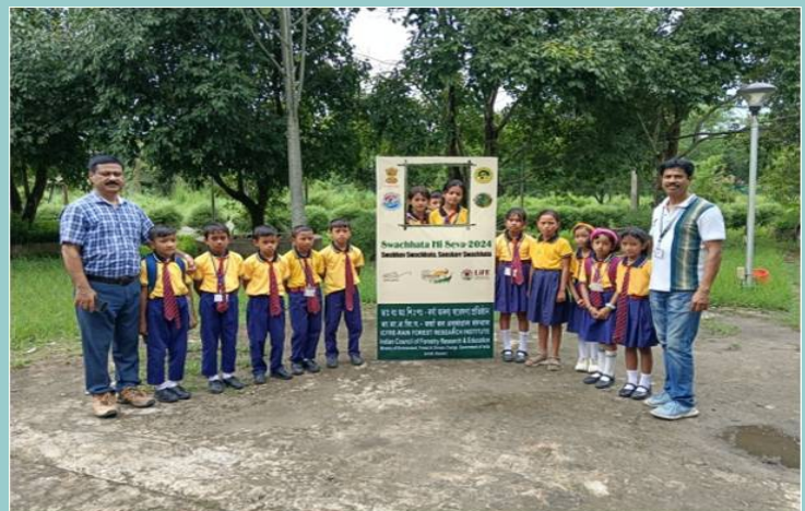
Visit of students from Dalakakharia Lower Primary School, Dhalajan, Jorhat to ICFRE-RFRI, Jorhat