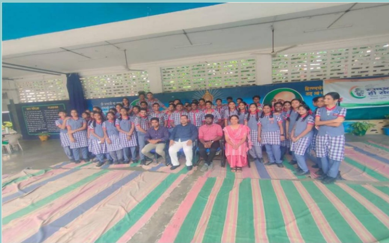
Visit of students from Kendriya Vidyalaya No.2, Vijayanagara to ICFRE-IFB, Hyderabad