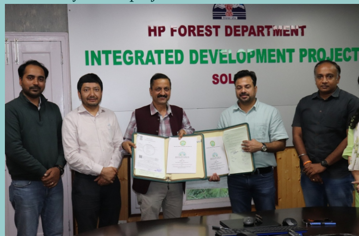
Signing of MoU between ICFRE-HFRI, Shimla and HP-IDP, Solan, Himachal Pradesh