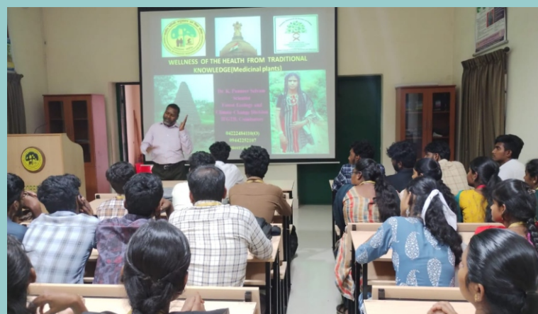
Visit of students from PSG Arts and Science College, Coimbatore to ICFRE-IFGTB, Coimbatore