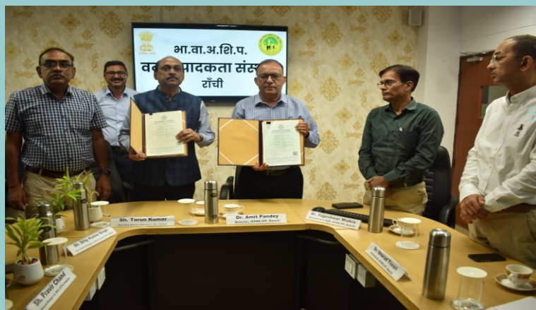
Signing of MoU between ICFRE-IFB, Hyderabad and Koderma Thermal Power Station, DVC