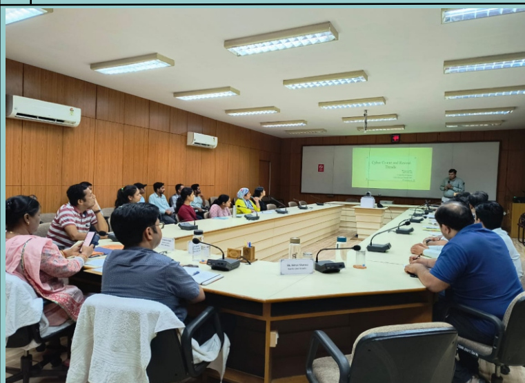
Training programme on “Cyber Hygiene and Security” by ICFRE-AFRI, Jodhpur