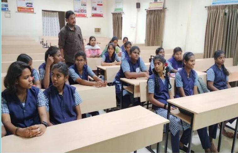
Visit of students from Govt. Girls Higher Secondary School, Singanalur to ICFRE-IFGTB, Coimbatore

Coimbatore and Govt Girls Higher Secondary School, Singanalur visited ICFRE-IFGTB, Coimbatore on 03 rd , 04 th , 08 th and 09 th October 2024. Lecture on Diversity of Flowering plant species of Western Ghats, Tamil Nadu, Benefits of Tree Planting, Glimpses of Plant diversity in North West Himalayas and Insect pest and diseases also delivered to students.