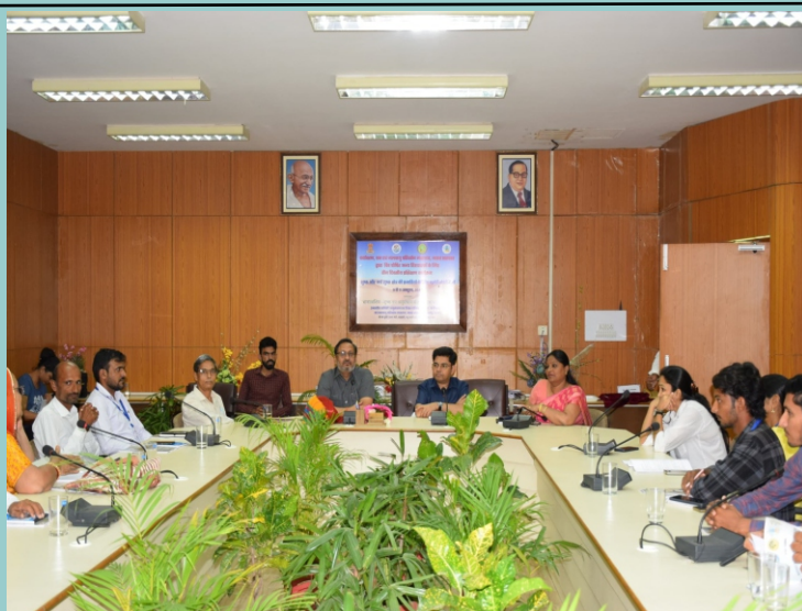
Training programme on “Nursery technologies for arid and semi-arid zone species” by ICFRE-AFRI, Jodhpur