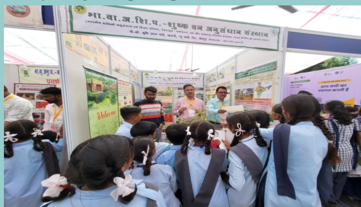
Stall by ICFRE-AFRI, Jodhpur in “Shashakt Rajasthan” at Abu Road, Sirohi, Rajasthan