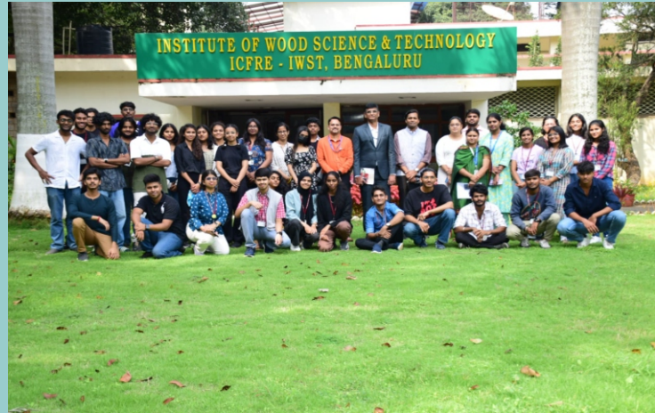
Visit of students from Dyananda Sagara University, Bengaluru to ICFRE-IWST, Bengaluru

College, Madurai, KLE Society's Nijalingappa College, Rajajinagar, Forest Research Institute, Dehradun and Dyananda Sagara University, Bengaluru visited Tissue Culture lab, Xylarium, Nursery, Wood Workshop, Advanced Wood Working Training Centre and Wood Museum of ICFRE-IWST, Bengaluru on 09 th , 16 th , 23 rd & 25 th October 2024. They were briefed about Wood Properties & Processing and Sandalwood Cultivation and its prospects.