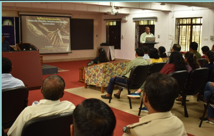
Workshop on “Molecular Diversity, Bioactive principles and Conservation of Ophicordyceps sinensis ” by ICFRE-IFP, Ranchi