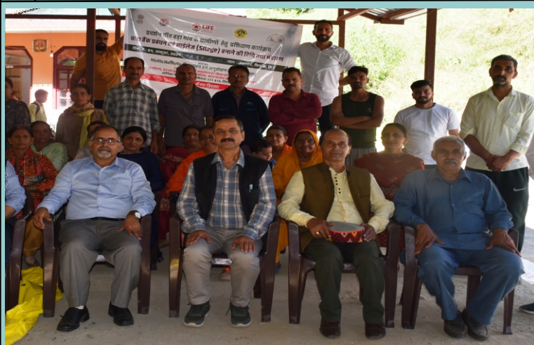
Training programme on “Fodder Bank Management and Silage Preparation and Storage Method” by ICFRE-HFRI, Shimla