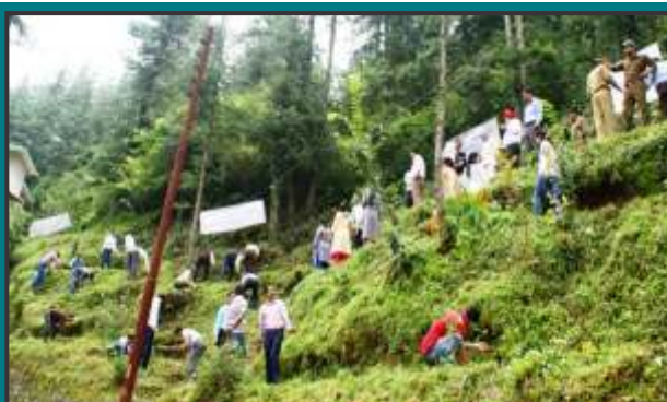
Celebration of Van Mahotsav at HFRI, Shimla