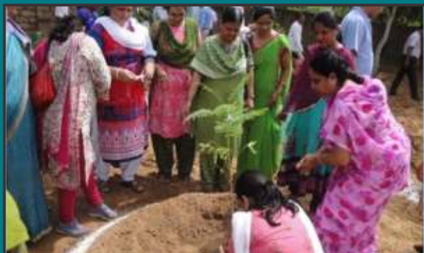
Celebration of Van Mahotsav at AFRI, Jodhpur