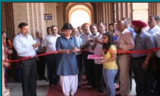
Exhibition inaugurated by Director, FRI and student visit during celebration on WED

Jodhpur; RFRI, Jorhat and HFRI, Shimla also observed WED. Various events such as Cleaning campaign, Awareness-cum-Training Programme, Extempore speech, instant slogan writing and Quiz competition for the students, villagers including women