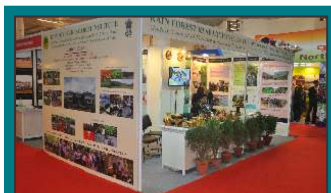
RFRI exhibition stall at "Destination North East, 2016 at Pragati Maidan, New Delhi