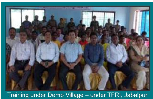
Training under Demo Village – under TFRI, Jabalpur