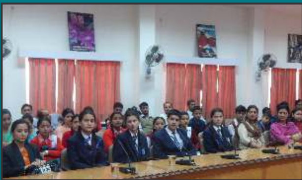
Celebration of IBD at HFRI, Shimla

Jodhpur; RFRI, Jorhat and HFRI, Shimla also observed WED. Various events such as Cleaning campaign, Awareness-cum-Training Programme, Extempore speech, instant slogan writing and Quiz competition for the students, villagers including women