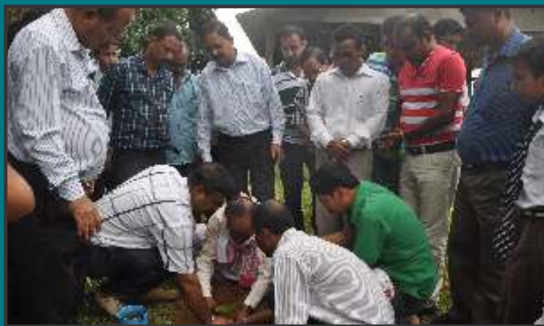
Celebration of WED at RFRI, Jorhat