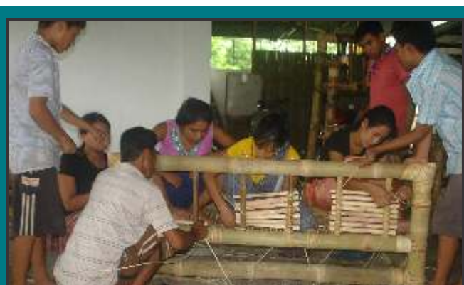
Bamboo Handicraft Training under DTC at RFRI, Jorhat