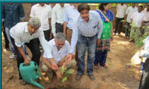
Plantation activity during celebration of the WDCD at AFRI, Jodhpur