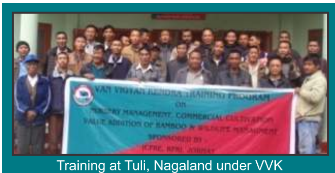
Training at Tuli, Nagaland under VVK