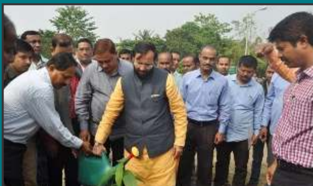
Visit of Shri Prakash Javadekar, Hon'ble Minister of State (Independent Charge), MoEF&CC