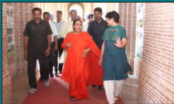
Sushri Uma Bharti, Hon'ble Minister for Water Resources, River Development & Ganga Rejuvenation visited FRI, Dehradun