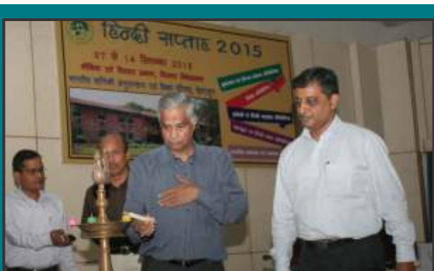
DG, ICFRE lighting the lamp during Hindi Week closing ceremony at ICFRE

IWST, Bengaluru conducted the following Rajbhasha activities :