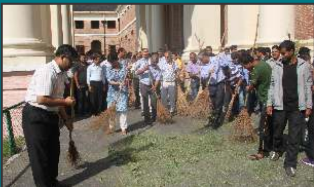
Swatchh Bharat Abhiyan at FRI, Dehradun