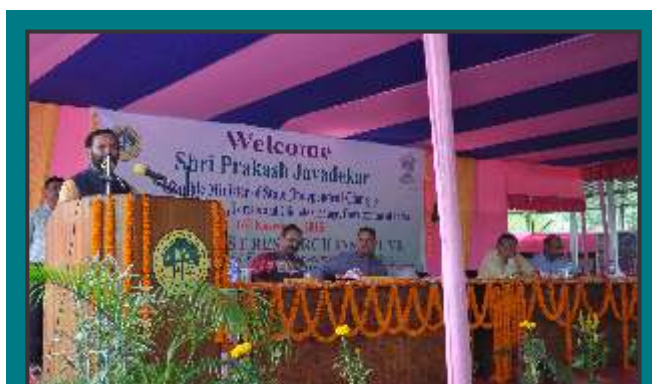
Hon'ble Minister, MoEF&CC addressing the gathering during Farmers' Meet