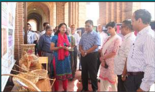
Inauguration of exhibition at FRI on Himalayan Day