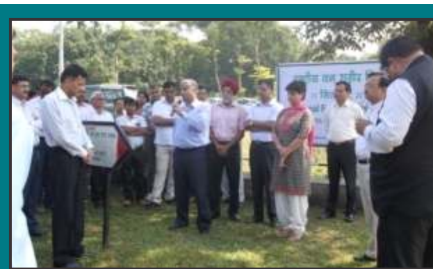
FRI, Dehradun observed National Forest Martyrs Day