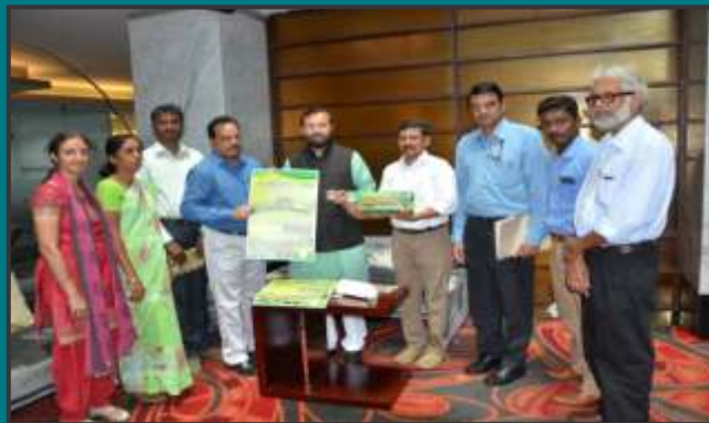
Vermico-IPM Growth Enricher released by Hon'ble Minister of state (IC), Shri Prakash Javadekar, MoEF&CC