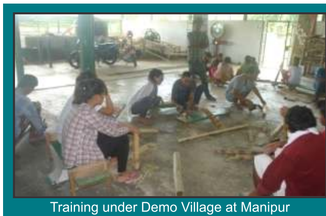
Training under Demo Village at Manipur