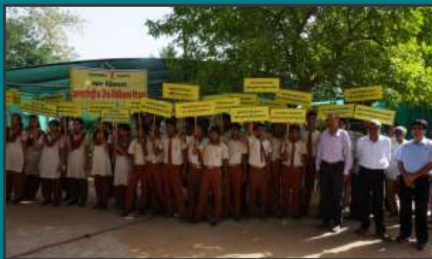
Celebration of IBD at AFRI, Jodhpur