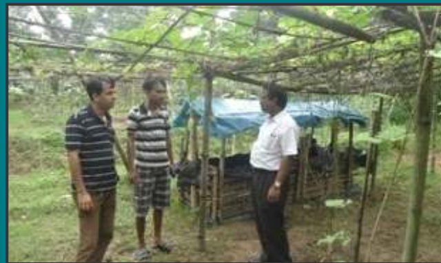
Low cost Vermi-composting Techniques disseminated by CFLE, Agartala