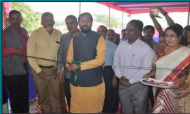
Inauguration of Exhibition by Hon'ble Minister of State (Independent Charge), MoEF&CC