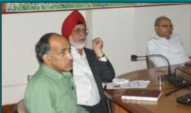
Celebration of IBD at HFRI, Shimla

and children were organized. A farmers' meet and consultation workshop on promotion of Forest- based Livelihoods for Environmental Security was also conducted on the occasion.