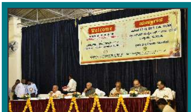
Sandalwood Growers Meeting organized jointly by IWST, Bengaluru & Sandalwood Society of India