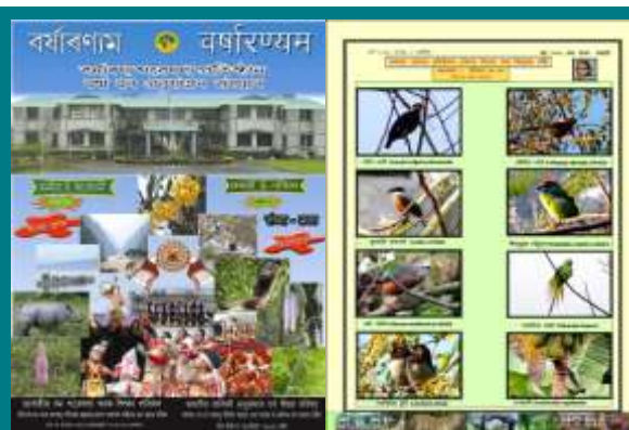
"Varsharanyam" Hindi & Assamese six monthly E-magazine